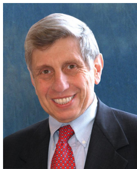
Hon. Abe Gafni

Wishing you and your families good health during this difficult time!